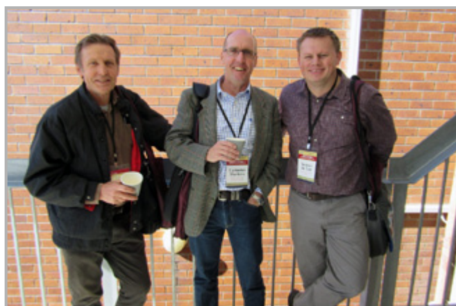
QHTA Conference delegates